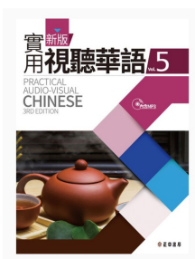
新版實用視聽華語5套 (附MP3)(第三版) Practical Audio-Visual Chinese 3rd Edition published in 2017 by Cheng Chung Bookstore

In addition to TMERC's comprehensive list of references, we selected 2 sets of quality publications by the Kang Hsuan Educational Publishing Group, a leading professional education publishing group in the field.