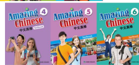
中文真棒 Amazing Chinese published in 2019 by Kang Hsuan Educational Publishing Group

Amazing Chinese is a complete Chinese language course developed for use in international school Chinese classes for grade 7-12. This language course conforms to the newest IGCSE curriculum standards, and was written in accordance with IB educational principles and AP Chinese teaching guidelines, and is thus well-suited for a variety of educational purposes. Vocabulary and expressions appearing in this course have been chosen based on their HSK levels, with additional attention paid to TOCFL vocabulary usage. Features: A wide variety of learning activities have been designed to allow for classes of students with uneven skill levels; Specially-designed listening and speaking exercises help students strengthen their comprehension and conversation skills; easily access lesson audio anytime, anywhere. VIEW MORE