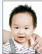
shows another person