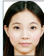
too close or hair touches the edge