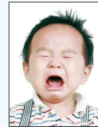
unnatural facial expression or crying