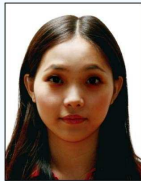
shadow across face