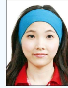
face and ears covered