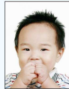
mouth covered by hands