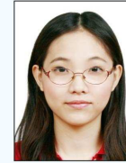
frames covering eyes