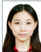
blurred, incorrect focus