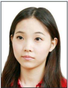
head not facing camera, looking away