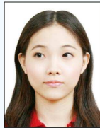
not looking directly forward