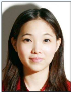
shadow behind the head