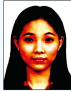
contrast too high