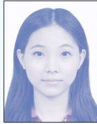
contrast too low, washed out color