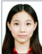
resolution too low