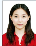
too far away