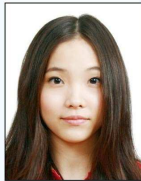
eyes or ears covered by hair