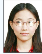
Flash reflection on lenses