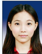
background colors are not identical