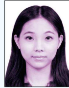
unnatural skin tones