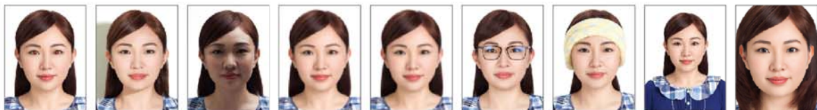
redundant shadow behind head shadow across face resolution too low blurred, incorrect focus flash reflection on lenses face and ears covered too far away too close or hair touches the edge