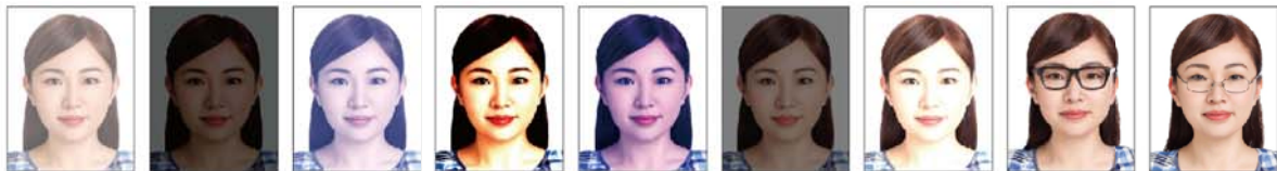
too light too dark contrast too low, washed out color contrast too high unnatural skin tones underexposed overexposed frames too heavy frames covering eyes