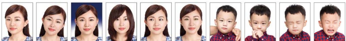
head not facing camera, looking away head tilted background colors are not identical eyes or ears covered by hair not looking directly forward wearing color or pupil distorting contact lenses show another person mouth covered by hands eyes closed unnatural facial expression or crying