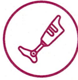
Prosthetics & Orthopedics