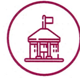
Government Services & Consultation Pavilions