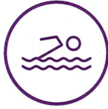
Exercise & Recreation