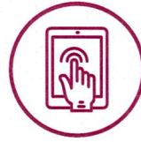
Smart & Long-term Care