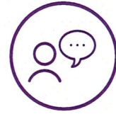
Communication & Information