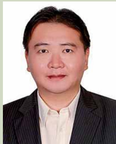
Hsu Li-ming, acting mayor of Kaohsiung

In 2015, Kaohsiung LOHAS Building 2.0 gave rise to the trend of designing functional balconies for new architecture projects in the city. The following year, universal design principles were implemented in Kaohsiung LOHAS Building 2.5, featuring residences accessible to all