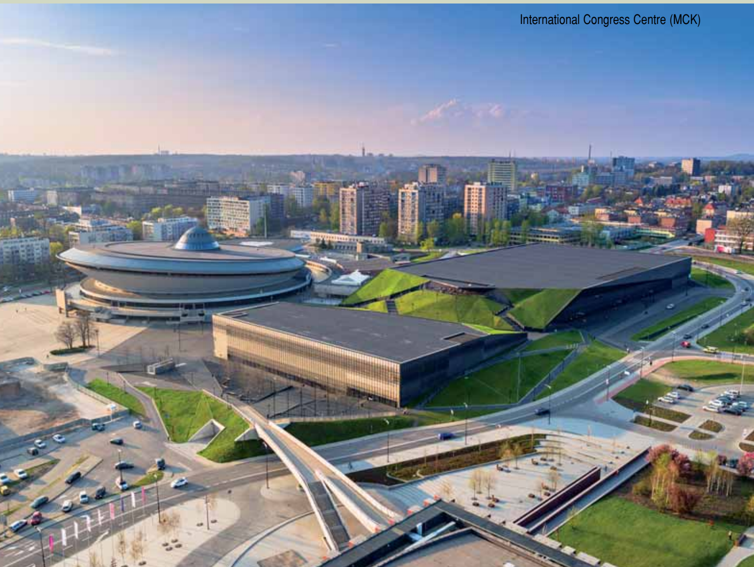
International Congress Centre (MCK)

After the great metamorphosis, the time has come for districts to change and for the transport system