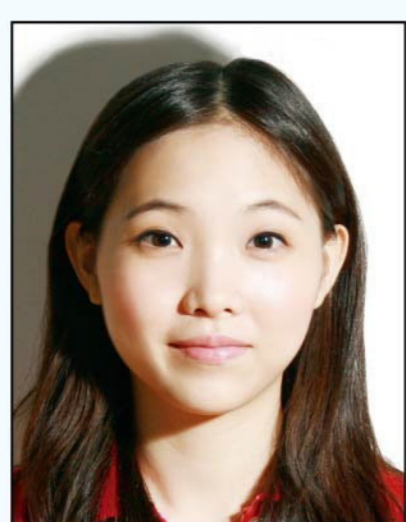
shadow behind the head