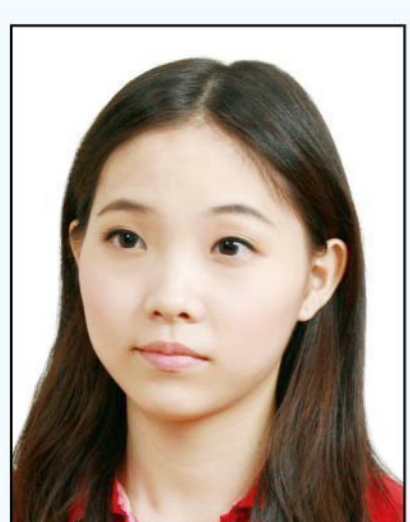
head not facing camera, looking away