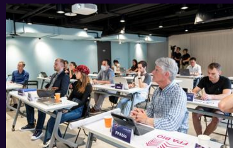
Lectures & workshops