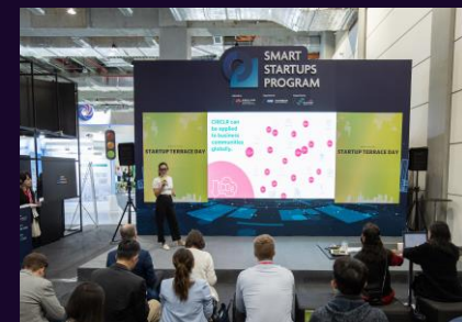
ST Day Pitch Show