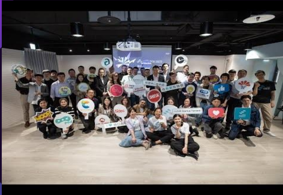
2023 Softlanding & FLASH Program (March) Recap @YouTube