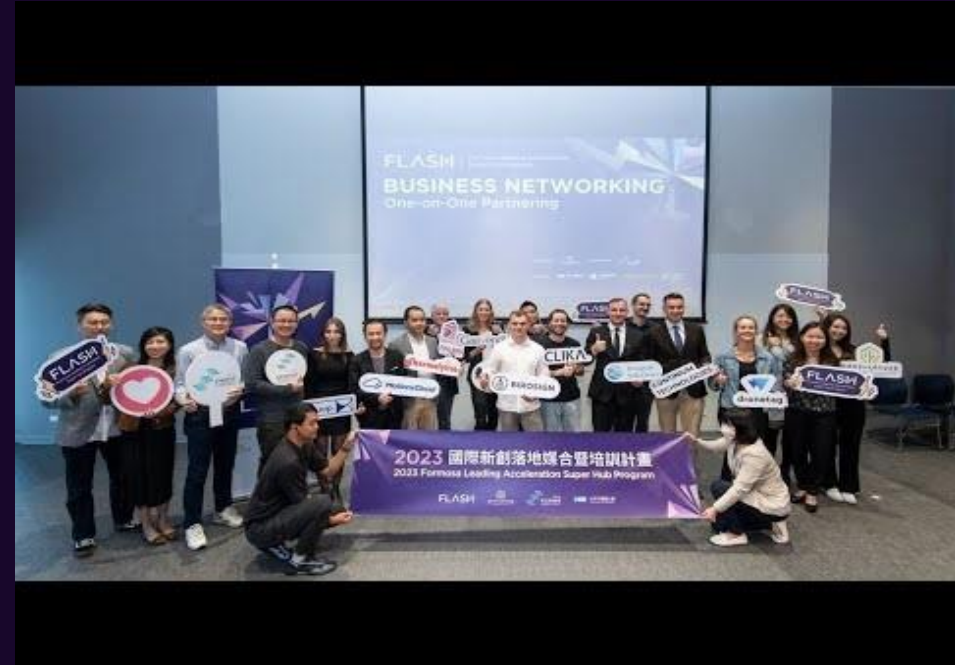
2023 Startup Terrace FLASH Program (OCT-NOV) Recap @YouTube