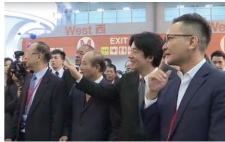
Premier Ching-Te Lai