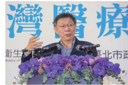
Taipei Mayor Wen-Je Ko