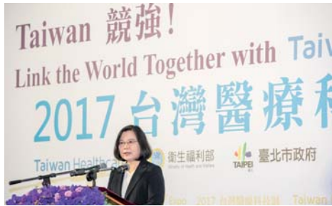
President Ing-Wen Tsai

◆ The inaugural Taiwan Healthcare+ Expo showcasing the entire health industry attracts government support!