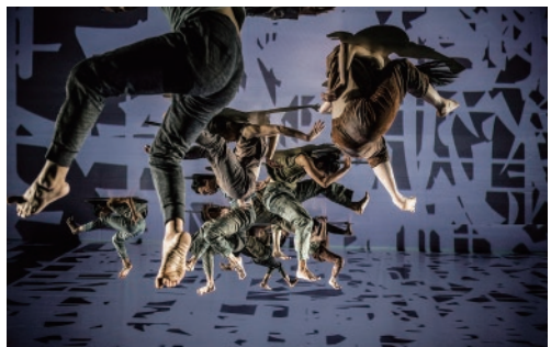
• LIN Hwai-min's Formosa performed by Cloud Gate Dance Theatre of Taiwan

Cloud Gate Culture and Arts Foundation is a non-profit organization, with a mission to create and perform dance works, to promote cultural activities, and to facilitate cultural development and cross-cultural exchange. It operates the Cloud Gate Dance Theatre of Taiwan and the Cloud Gate Theater in Tamsui. Founded in 1973 by internationally renowned choreographer, LIN Hwai-min, Cloud Gate is acclaimed as "Asia's leading contemporary dance theater" (The Times), and "One of the finest dance companies in the world" (The Globe and Mail). While touring extensively worldwide, Cloud Gate holds regular seasons in theaters at home, and stages annual free outdoor performances in cities and villages of Taiwan, drawing an average of 30,000 people per performance. Cloud Gate Theater, operating since 2015, is home to Cloud Gate Dance Theatre of Taiwan. The Theater has presented performances and activities by Cloud Gate and visiting artists from Taiwan and abroad and has become a popular cultural hub of northern Taiwan.