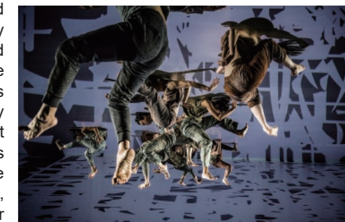
• LIN Hwai-min's Formosa performed by Cloud Gate Dance Theatre of Taiwan • Photo LIU Chen-hsiang ©Source: Cloud Gate Culture and Arts Foundation

Website: https://www.cloudgate.org.tw/en/