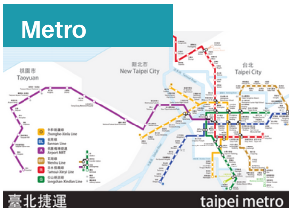
臺北捷運 taipei metro