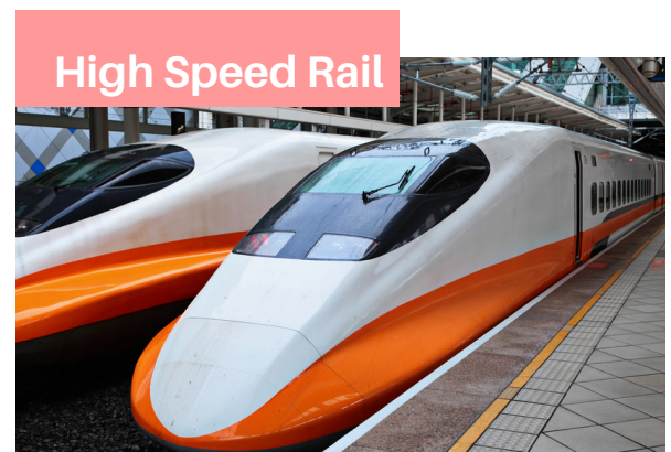
High Speed Rail